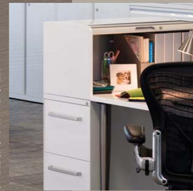
The tallest Tower 4 unit provides extra space with adjustable shelving Tower 2 slots under the desk and out of the way of the worktop